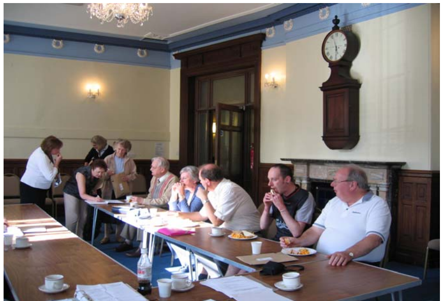
Leaseholder Club Members at June 2005 meeting

A new information pack for new leaseholders is being launched and will include the leaseholder guide, a welcome letter from the leaseholder club and a satisfaction survey. If there's anything you think would be a good idea to include in the pack contact Sue Mallinson on 01539 717717.